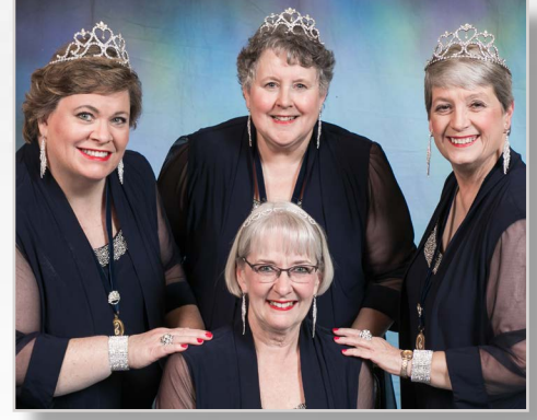
Change of Heart • 1999