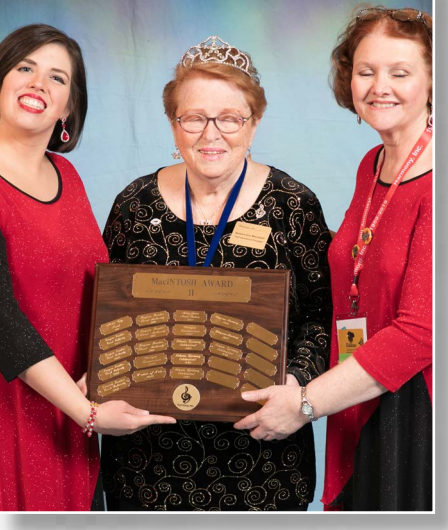
MacIntosh Award Bluegrass Harmony