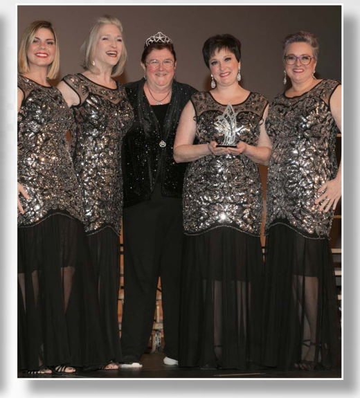
Findlay Plaque Resolution