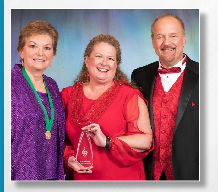
G. Ruth Geils Memorial Award Lake Ridge Legacy Chorus